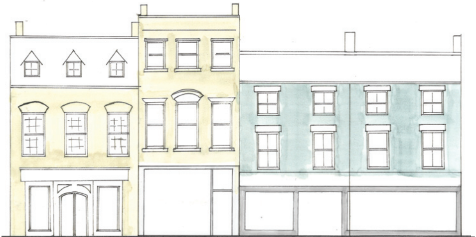
Bad example of shop frontage

It is important when designing the new shop front that it should be in proportion to the building. Shop frontage that covers, cuts or removes existing features such as pilasters, date stones, windows to the first floor, or other important