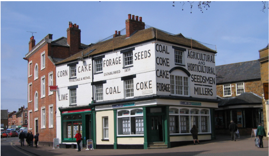
Advertising on building with hand written signage – a traditional, Victorian method of advertising – now protected by statutory listing.

As a general rule the size of lettering should be designed to relate to the overall size of the building and to the depth and length of the fascia. The lettering should be well spaced and well proportioned.