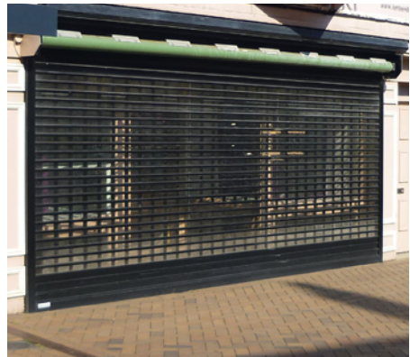
Photograph showing open grill which does not close the active frontage and provides security.