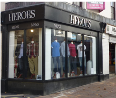
Good use of simple design with plain mullions complementing products sold.

Although there is a wide range of design solutions to any given place, the design of the fenestration, the detailing, the choice of materials and the balance of new to old should relate to the building as a whole. The installation of a 'traditional' shop front will not always be appropriate. Some premises are constructed in a style where a contemporary design would be more suitable. The individualism of each buildings frontage can be important to the overall appearance of the street and therefore alternative styles may be acceptable, subject to the character of the building in which they are proposed.