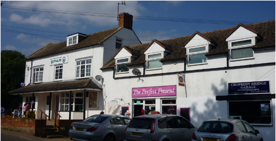
Cropredy – rural shops in a village setting.

Colours do not have to be deemed as traditional. They should be complimentary to both the surroundings, the materials, the building, its neighbours and to the period of the property.