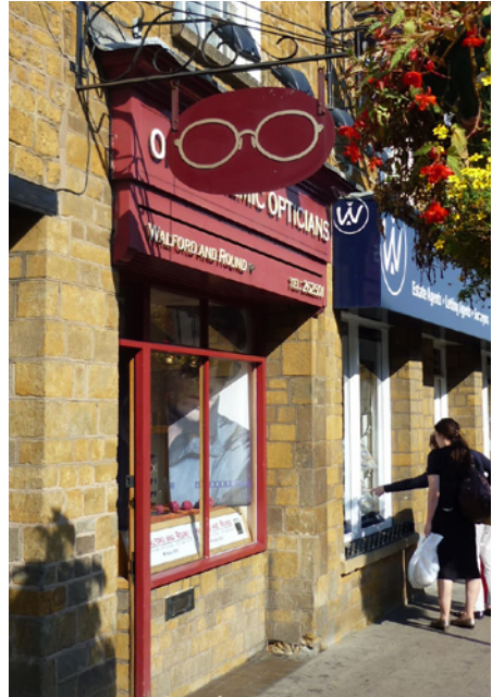
Banbury – Hanging sign showing visual image of the goods