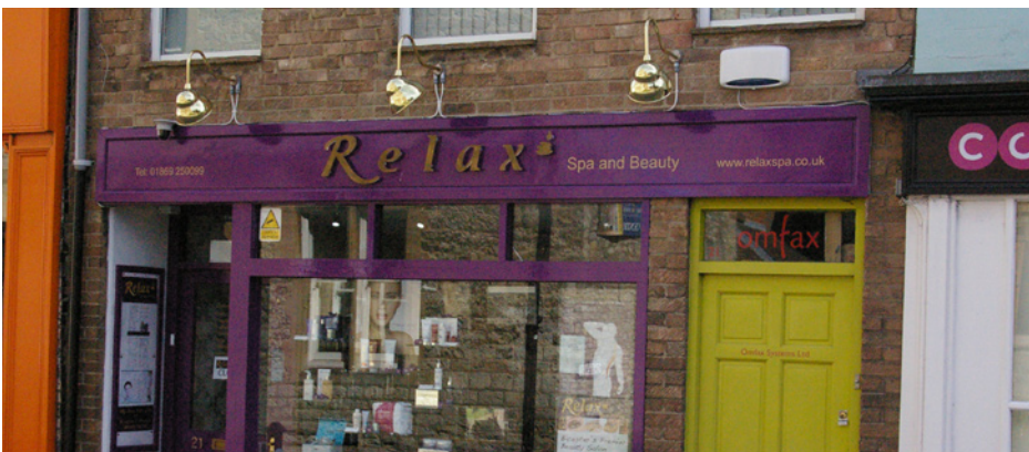
Discreet trough lighting blending in with the shop signage.