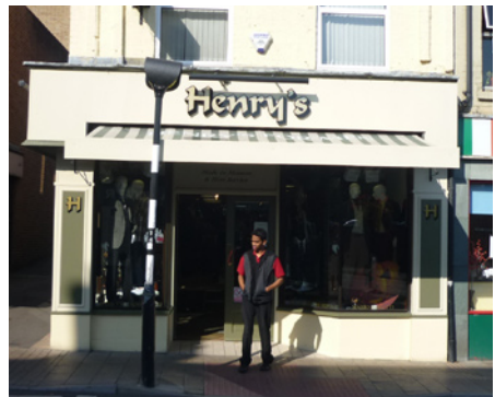
Banbury – Simple canopy design