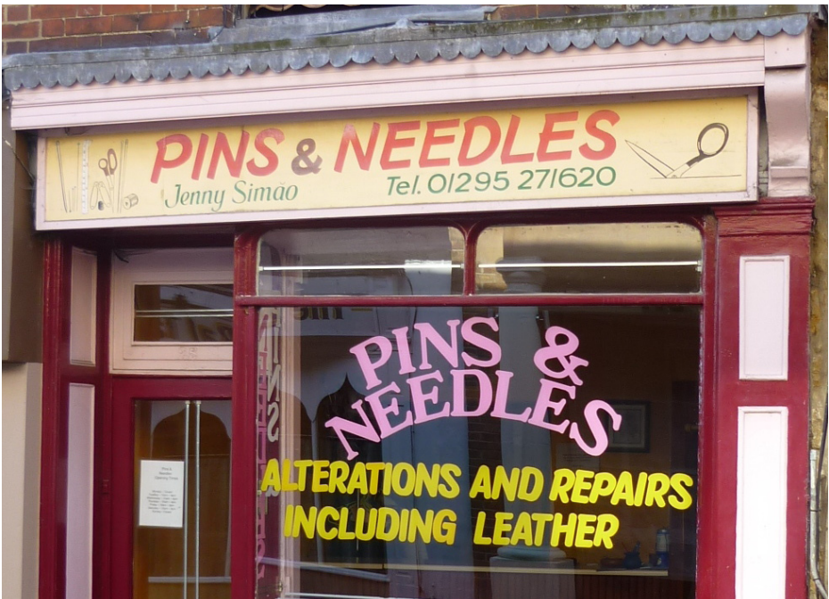
Banbury – Advertising sign written onto the shop fenestration

Blanking out windows with advertising is strongly discouraged as this reduces active frontage. Open window displays allow potential customers a view into the shop.