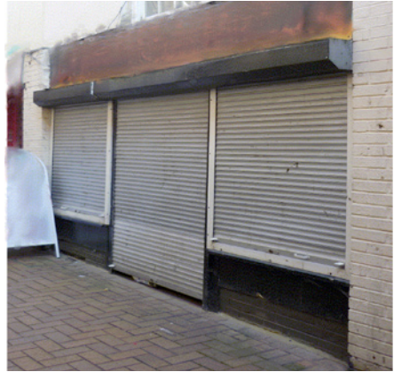
Photograph showing closed or solid grill which provides a negative image.

The use of permanently fixed external grills will not be permitted in public places. Installation of these grills at the rear of a property may create an accessible climbing system enabling illegal access to this or adjoining buildings.