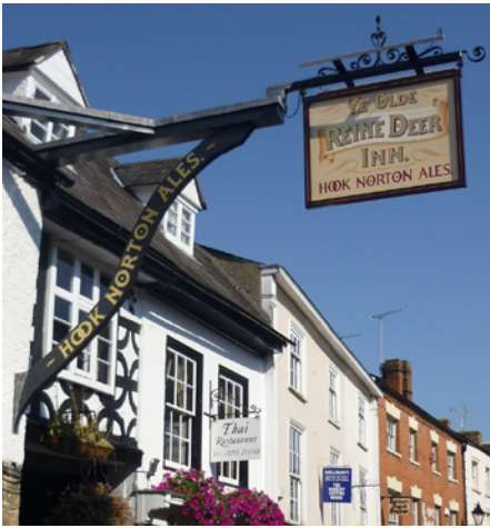
Banbury – Large hanging sign making a good visual reference to location and part of wayfinding.

A hanging sign should ideally be constructed of timber or metal and painted with details of the shop. They can be made more individual by being applicable to the type of retail unit eg cut in the shape of a boot for a cobbler or shoemaker.