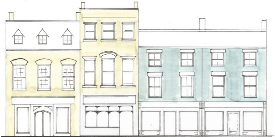
Good example of shop frontage