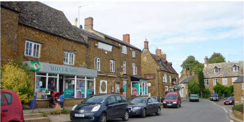
Hook Norton - Large shop hidden behind a multitude of frontages. This retains the character of the buildings and the street scene

The vertical sightlines should stop at the top of the shop front, typically with the cornice, without interfering with the building above. This visual break will vary in height with the building.