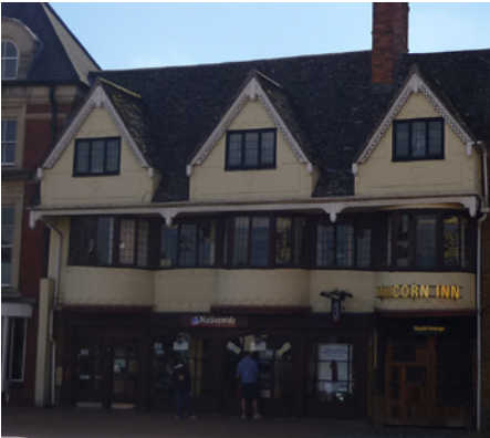
Banbury – Nationwide with external ATM integrated into design of shop front

Where machines are installed externally, early consideration should be given to integrate them into the overall design of property.